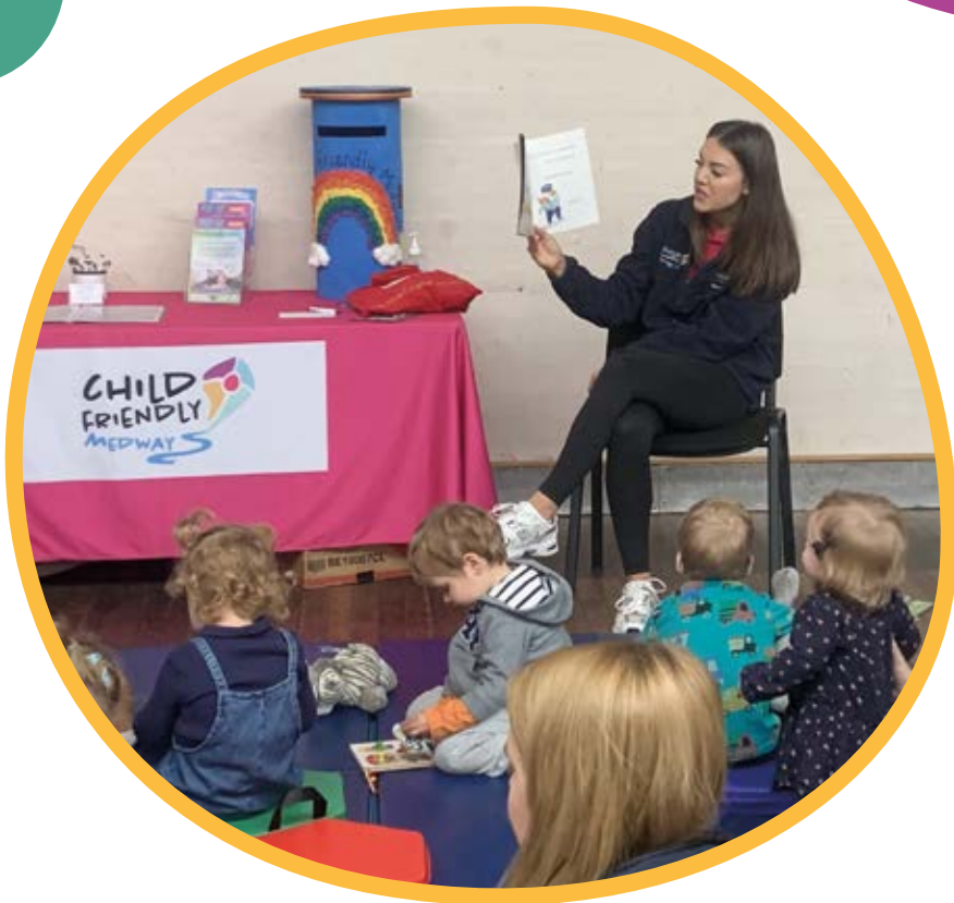
Pop-Up Community Storytime Sunlight Centre, Gillingham