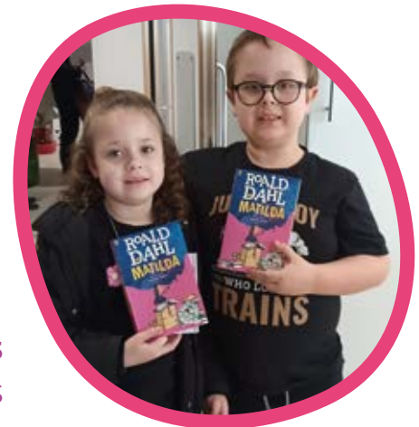
Book-themed events Various locations