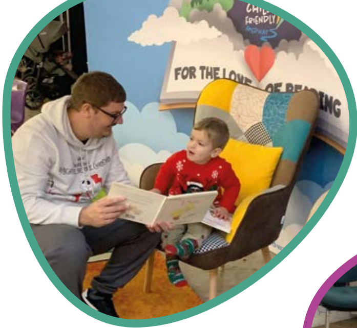
Soft Play and Story Corner The Pentagon Shopping Centre, Chatham