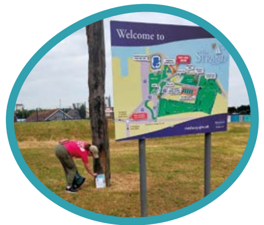
Book Trails Various Locations