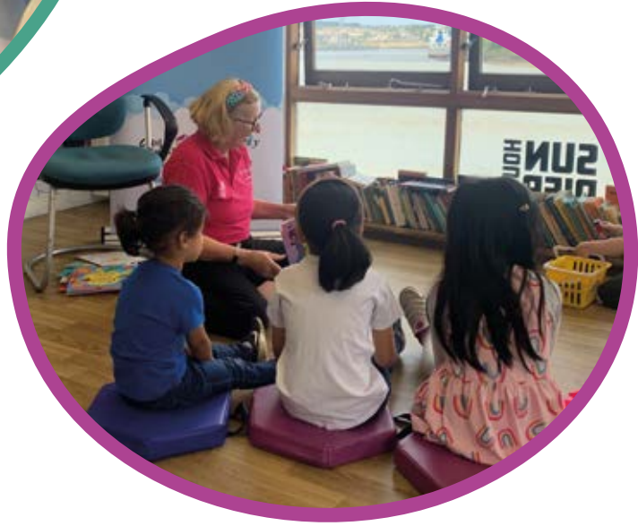
Storytime and Snacks Sun Pier House